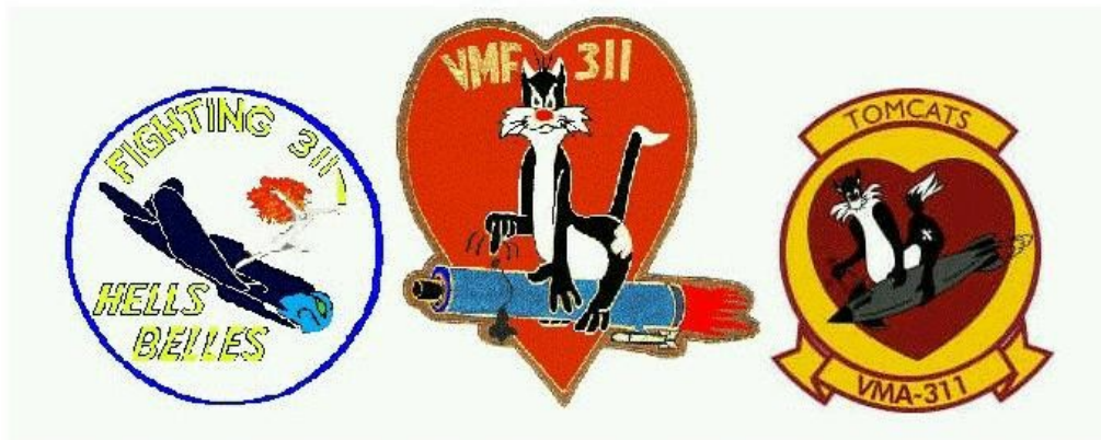
Hells Belles from World War II, Whiskey Lovers in Korea and Tomcats Viet Nam to Present