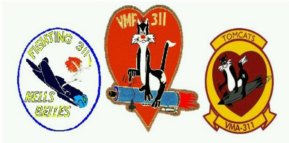
Hells Belles from World War II, Whiskey Lovers in Korea and Tomcats Viet Nam to Present